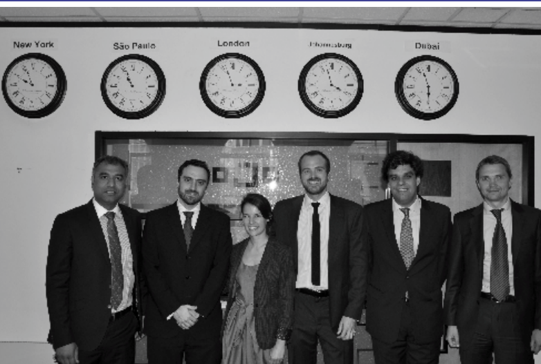
2013 Winners: INSEAD Business School