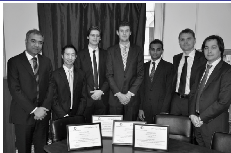
2012 Winners: University of Cambridge