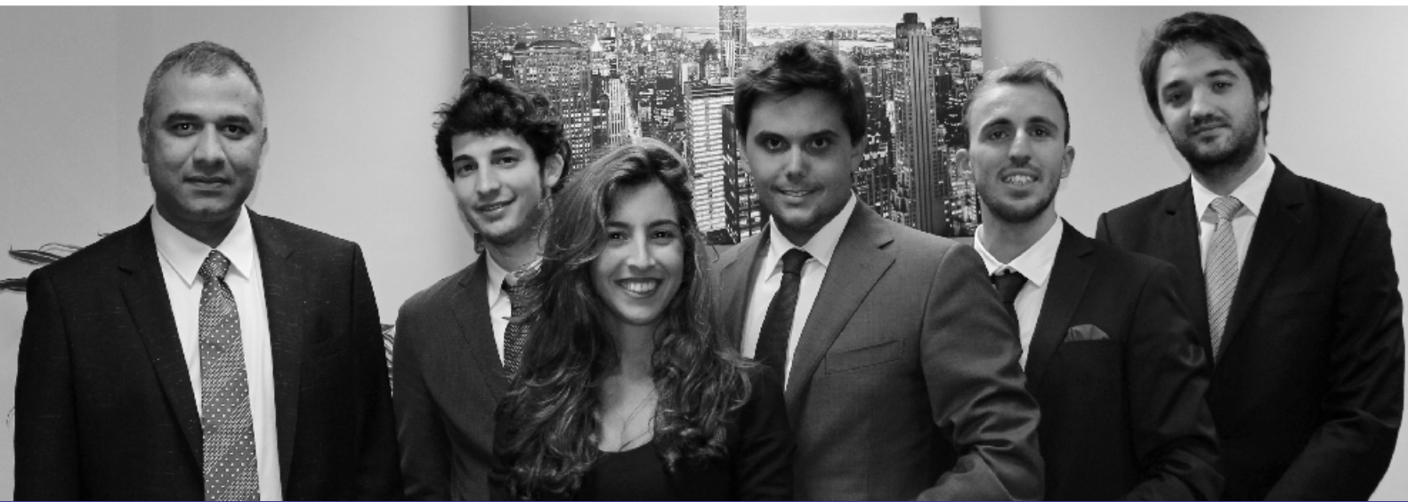
2014 Winners: Polytechnic University of Milan